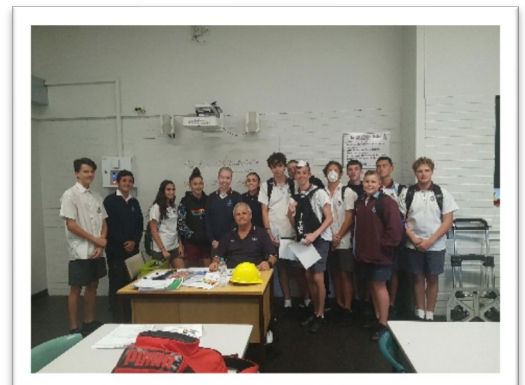
White Card Accreditation held here at JHS